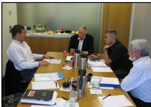
CICA - EWPA Meeting 16/6/11

Tooleys Crane Hire Town & Country Crane Hire P/L TRAM Australia Pacific P/L Turner & Central Crane Service Tutt Bryant Heavy Lift & Shift Two Way Cranes & Rigging P/L UGL Resources P/L Universal Cranes P/L (Ballina) Universal Cranes P/L (Wynnum) Venables Precast Wagga Mobile Cranes P/L Warringah Crane & Transport WATM Crane Sales & Services Websters Transport P/L Westlift Crane Hire Whiters Street Cranes Williams Cranes & Rigging P/L Williamstown Crane Hire Wollongong Cranes P/L Worksafe Training Centre Youngs Crane Service