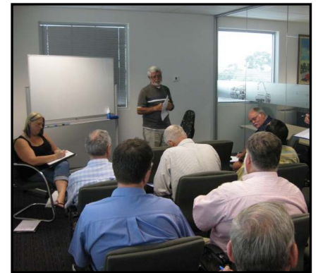
CraneSafe Victorian Assessors Meeting 4/2/11 at the CICA Office

Not that we can solve every problem. Everyone in business has his own obligation to know all of the regulations and to conform to them, but we can assist in providing our members with the tools to overcome the myriad of legal obligations being imposed. This is the unknown and untrumpeted work that CraneSafe and CICA do. As you would imagine, the $27 hirer's membership does not go a long way to pay for 5 specific CraneSafe staff and an office, so the cost of the CraneSafe Green Sticker is used to pay for these staff in addition to paying for safety initiatives that the crane industry requires.