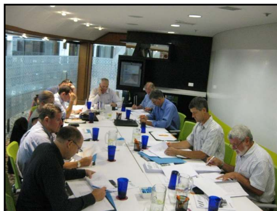
CICA's OH&S special workshop held 16/2/11 at the Crowne Plaza Hotel Melbourne