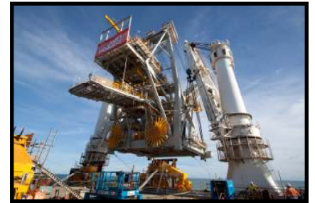
2010 Winning Category A Lift - John Holland Pty Ltd

❖ The CICA Lift of the Year Awards Program is a major part of our annual activities (sponsored by Cranes & Lifting magazine). I congratulate the 2011 nominations announced in the August Newsletter, in total 5 entries. I take this opportunity to encourage the Members to further support these important awards, a significant way we celebrate our industry. Please begin your planning for next year's Awards now.