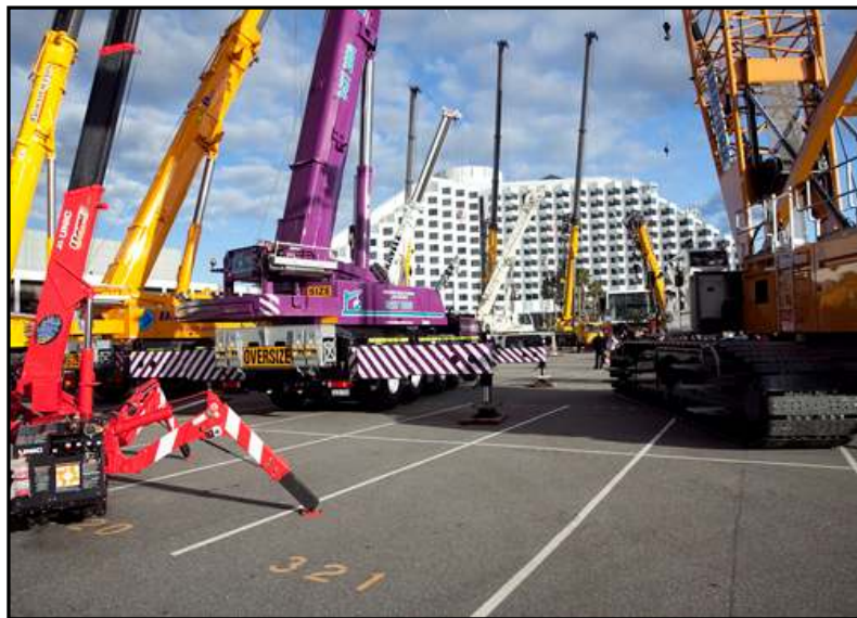
2010 CICA Conference Crane Display (Perth)

Presented at the CICA Annual General Meeting 14 th September, 2011