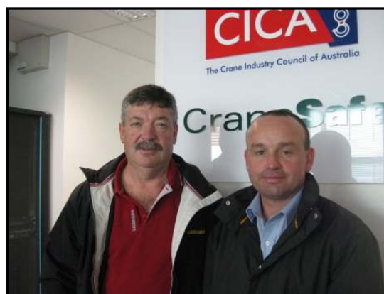
Liebherr Visits CICA Office