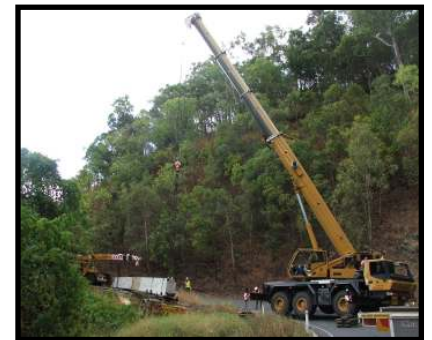
2010 Winning Category B Lift - Kelly's Crane Hire

To the Members: on behalf of the CICA Board and Office Team, I thank you for your continued support and contributions. As always, it's your industry.