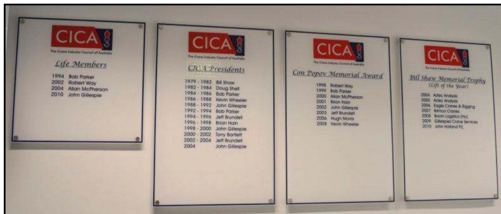
Honour Boards, CICA Office