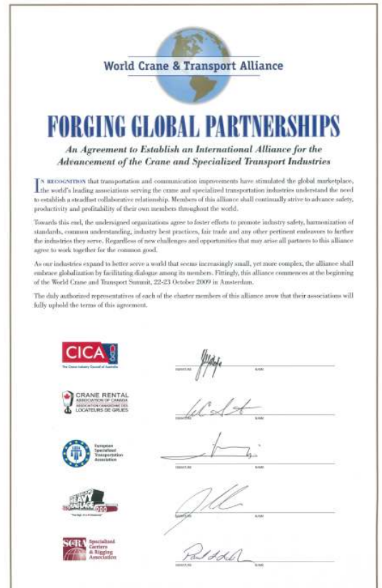
World Crane & Transport Alliance Certificate