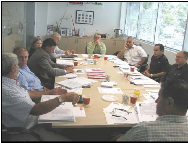
CICA Board Meeting 17/2/11 at the CICA Office